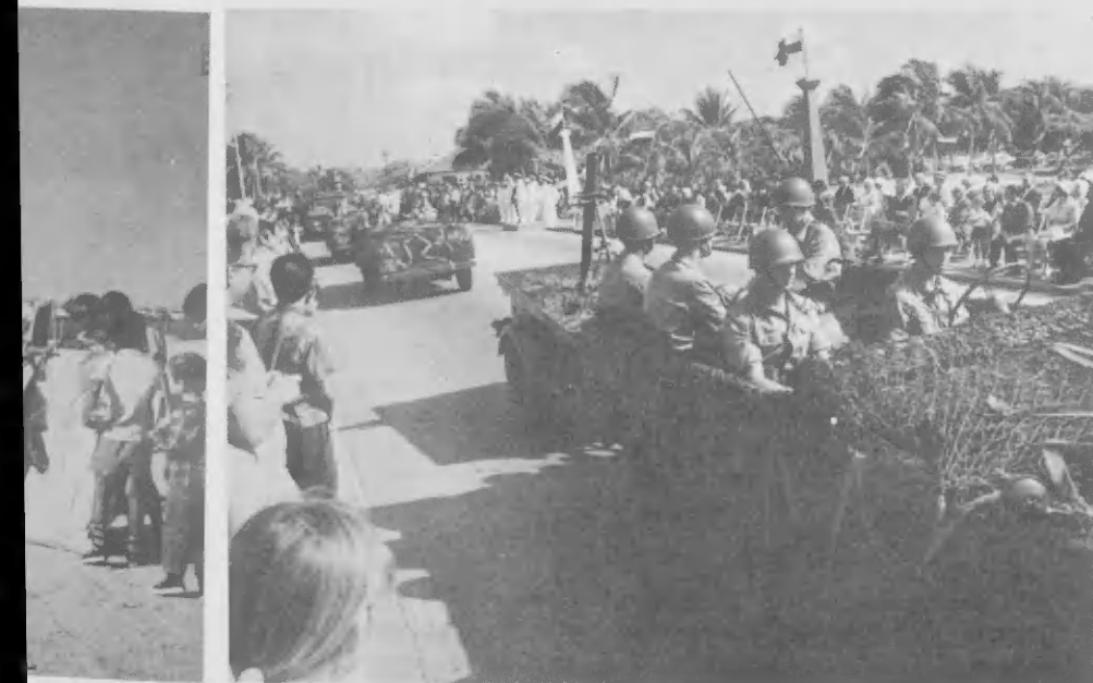
Marines' armored parade - Parada cu auto arma.